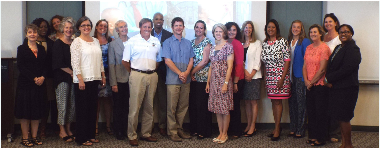
Above: COPP grantees, Technical Assistance Providers, and Healthcare Georgia Foundation staff members

Georgia coalitions made substantial progress in achieving policy and environmental changes.